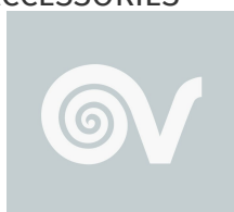
NKE ROD 160 Code 21150