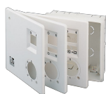
KIT SCB5 (TRASF.5 V.)