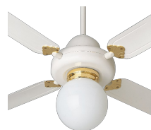
DECOR LIGHT KIT (KIT LUCE)