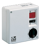
SCNRL5 UNIF. X NK SOFFITTO