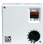
SCNR5 UNIF. X NK SOFFITTO