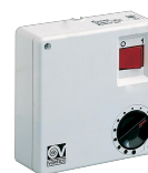
C 2.5 (COMANDO EL. 2.5 A) Code 12967