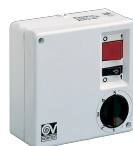
SCNRL5 UNIF. X NK SOFFITTO Code 12957