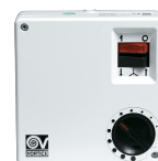
SCNR5 UNIF.X NK SOFFITTO Code 12955