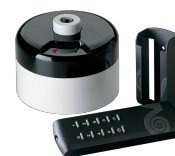
TELENORDIK 5T Code 22387 →