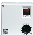
← SCNR5 UNIF.X NK SOFFITTO Code 12955