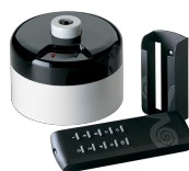
TELENORDIK 5T Code 22387