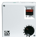
SCNR5 UNIF.X NK SOFFITTO Code 12955