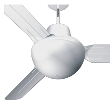
EVOLUTION LIGHT KIT ES Code 22414