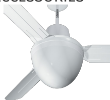
EVOLUTION LIGHT KIT Code 22413