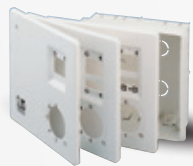
KIT SCB (code 22481)