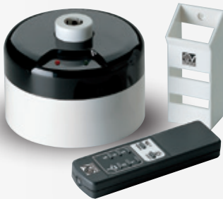
TELENORDIK 5T (code 22387)