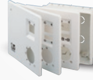
KIT SCB5 (code 22483)