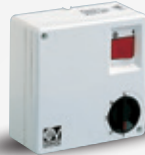
SCNR5 (code 12955)