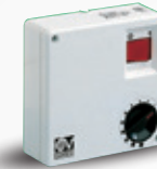
C 2.5 (code 12967)