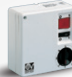
SCNRL5 (code 12957)