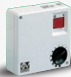
SCNR/M (code 12982)