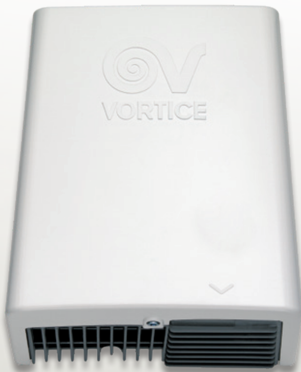
PREMIUM DRY A cod. 19224

Automatic models are fitted with an infrared device which starts the product automatically when hands enter the sensor detection field, which can be adjusted using a "trimmer" inside the product.