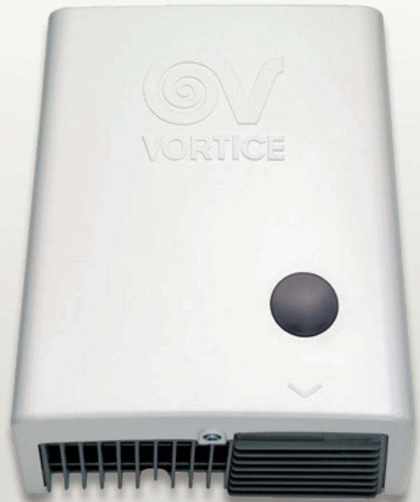
PREMIUM DRY cod. 19225