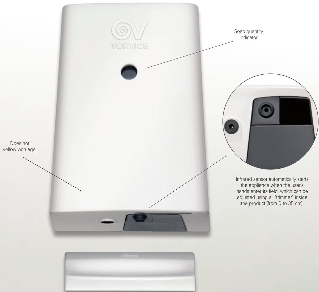
PREMIUM S DISPENSER cod. 19228