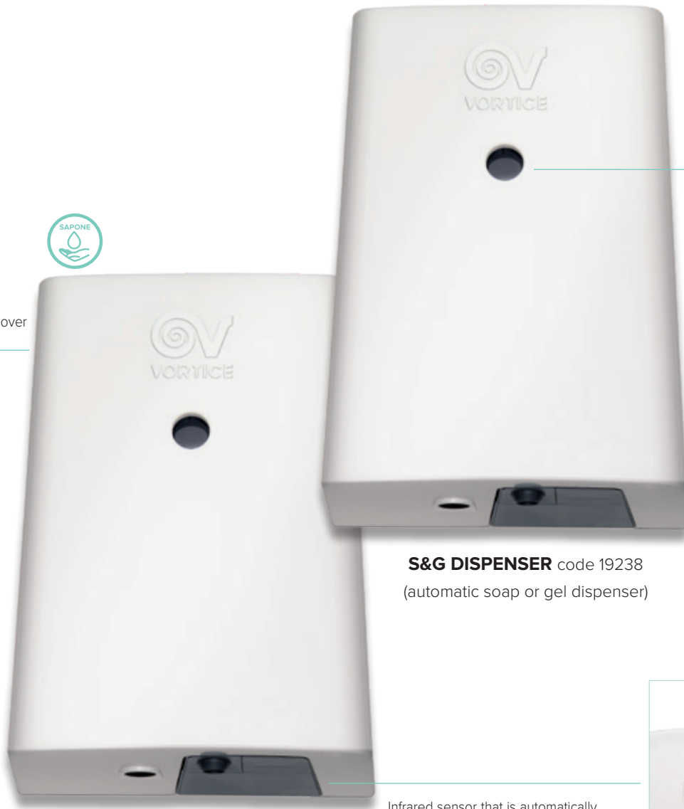
S&G DISPENSER code 19238 (automatic soap or gel dispenser)