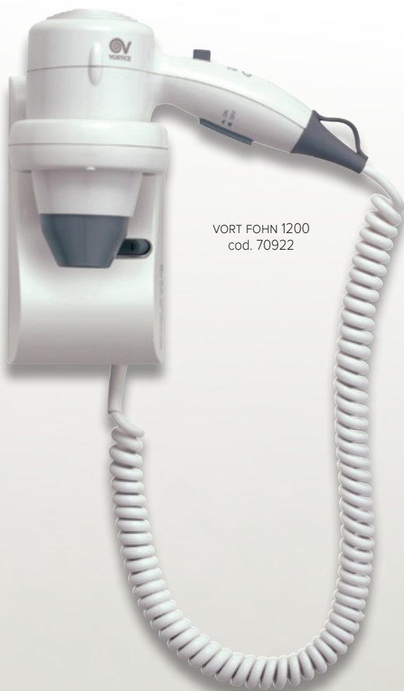
VORT FOHN 1200 cod. 70922