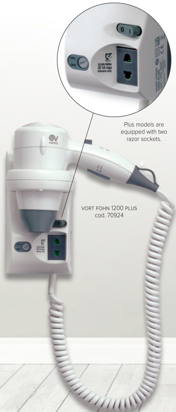
VORT FOHN 1200 PLUS cod. 70924

Plus models are equipped with two razor sockets.